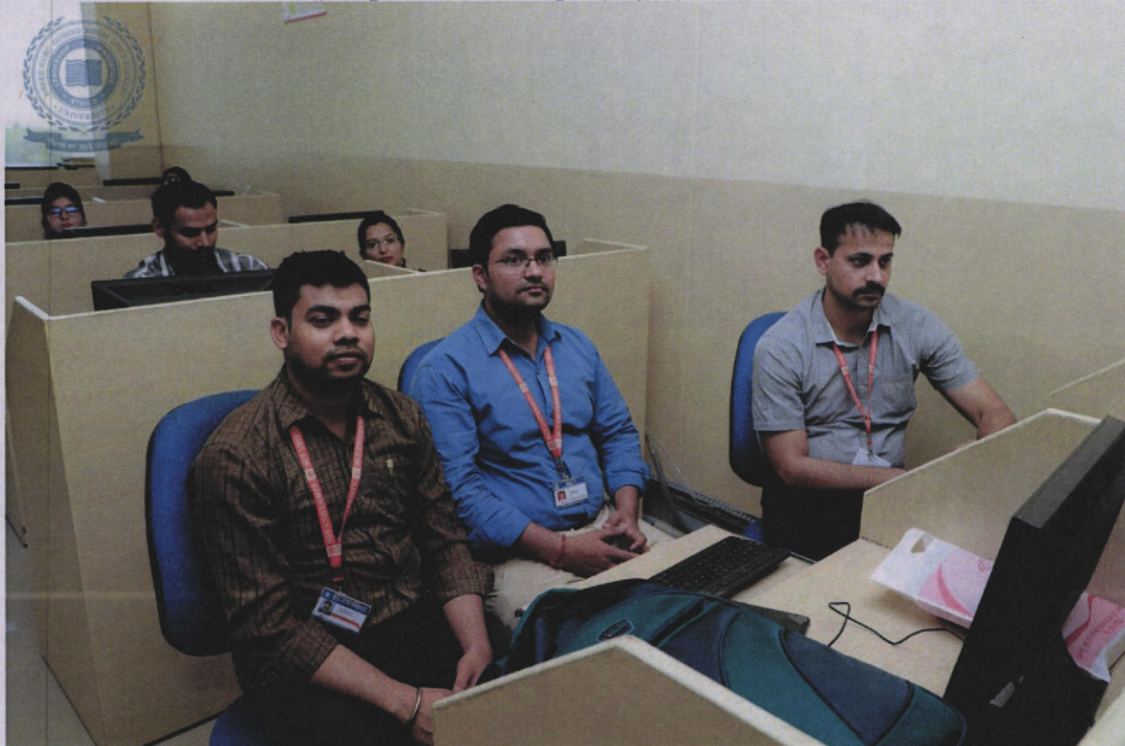
Participants involved in the training session on "ANSYS"

Budhera, Gurugram-Badli Road, Gurugram (Haryana) – 122505 Ph. : 0124-2278183, 2278184, 2278185