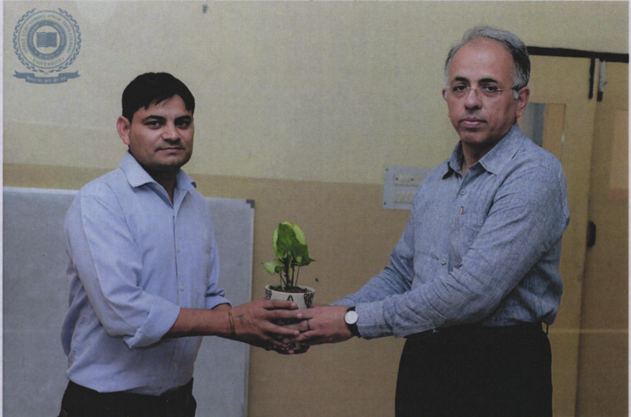
Honour to the Guest Speaker

Budhera, Gurugram-Badli Road, Gurugram (Haryana) – 122505 Ph. : 0124-2278183, 2278184, 2278185