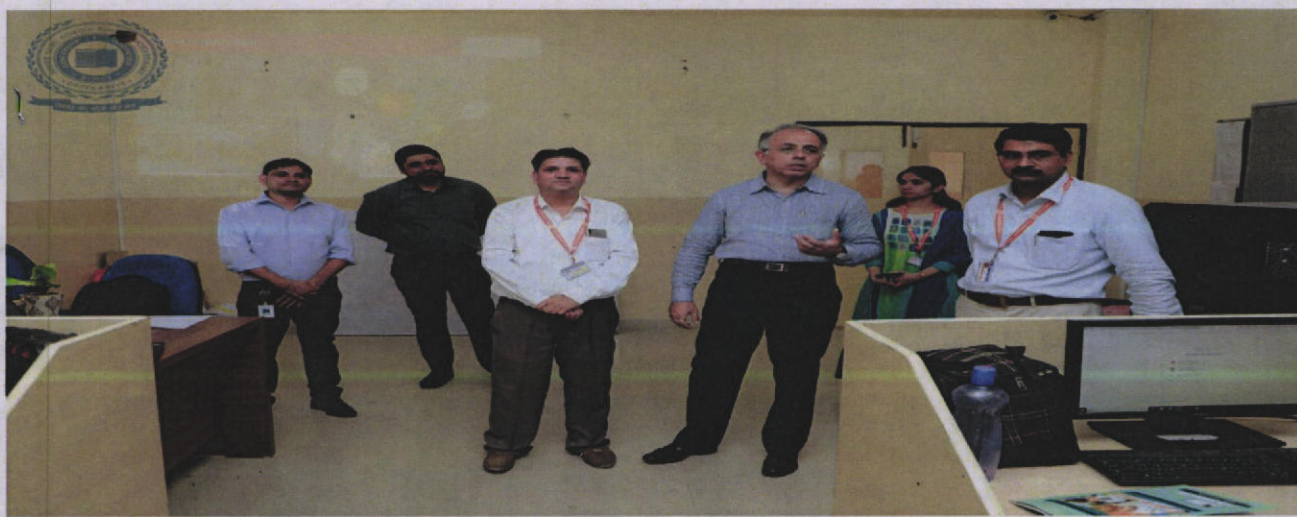
Delegates of the Training Programme